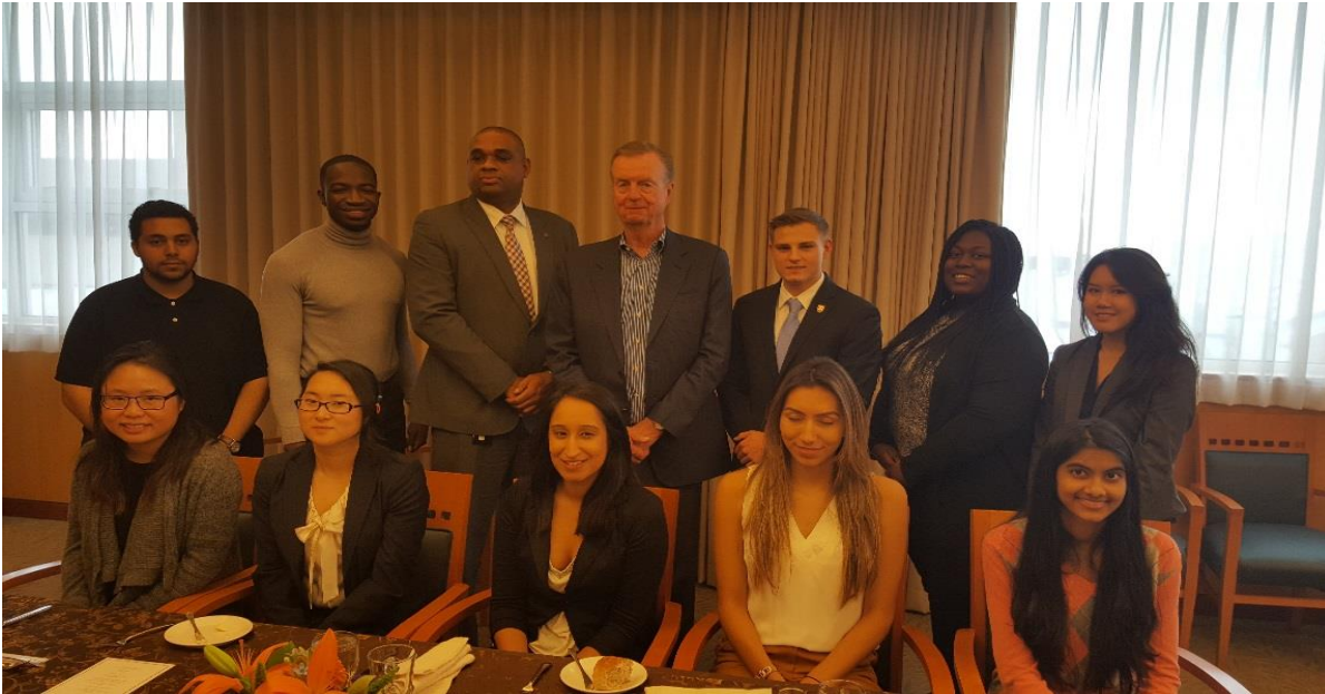
Cullen family scholarship past winners and Rutgers students

It is an honor for me to be the coordinator of this amazing program. The Barcelona Exchange Program has been very successful thanks to the hard work and cooperation of our World Language Department, Piscataway High School faculty and staff and our community.